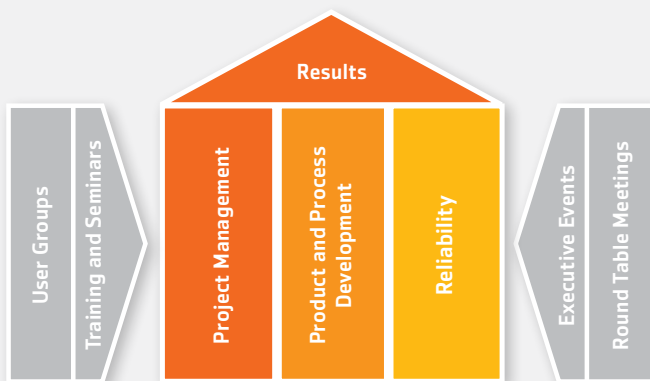
The Holland Innovative House : ■ core ■ results ■ enablers

You are invited to bring your own cases to analyse during the training.